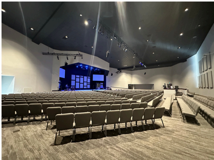
Main Worship Center